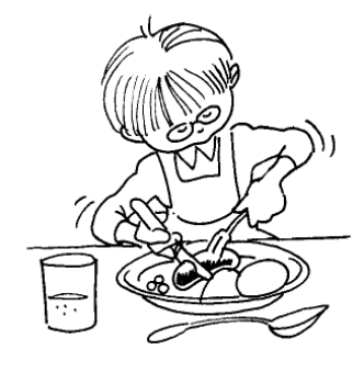
Use a knife and fork