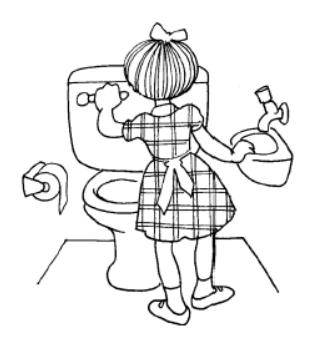
Use the toilet properly and flush it