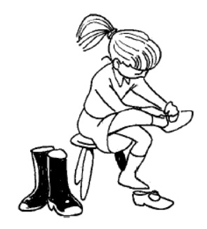
Change shoes and pumps.