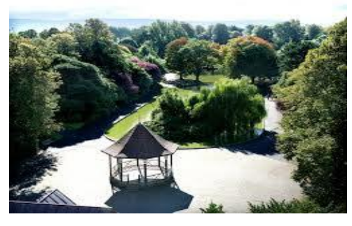
Herbert Park Football & Gaelic Pitches