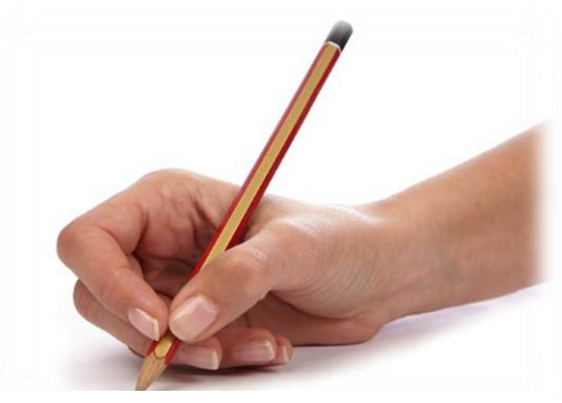
This is an example of the correct tripod pencil grip.